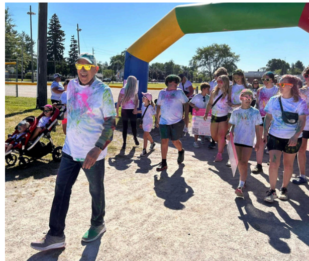
Ready, Set, Go!